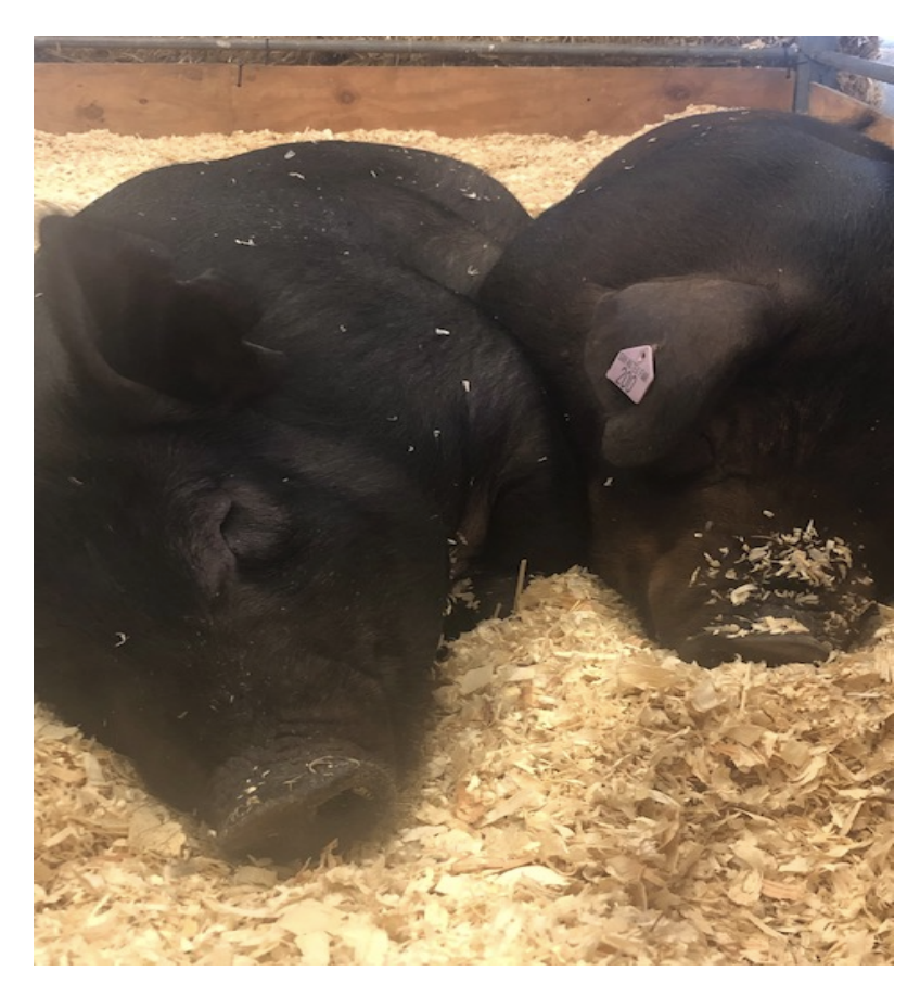
Chili & Pepper have been resting in the heat. They get exercised twice a day in the arena by the kids in our Pen Pride project.