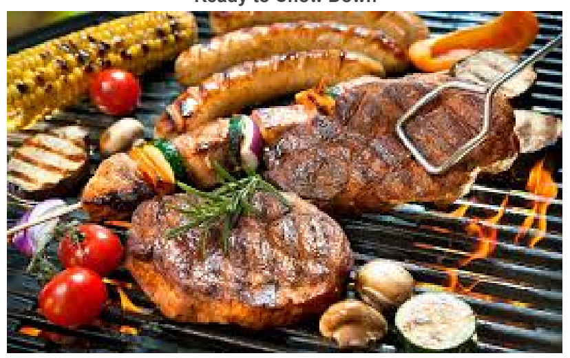
Ready to Chow Down

Did you know that as a 4-H family you can feast on a free dinner at fair? Each club hosts one night of dinner. They typically start serving around 6:30pm in the designated area near Gate 9 across from the barn. Please note there are no dinners on the following nights: